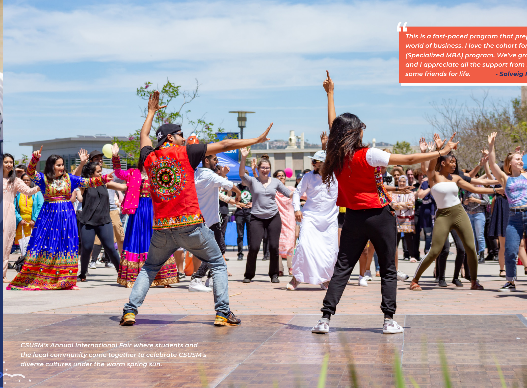
CSUSM's Annual International Fair where students and the local community come together to celebrate CSUSM's diverse cultures under the warm spring sun.