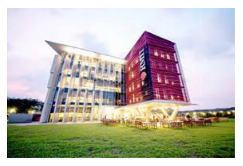
Saigon South Campus