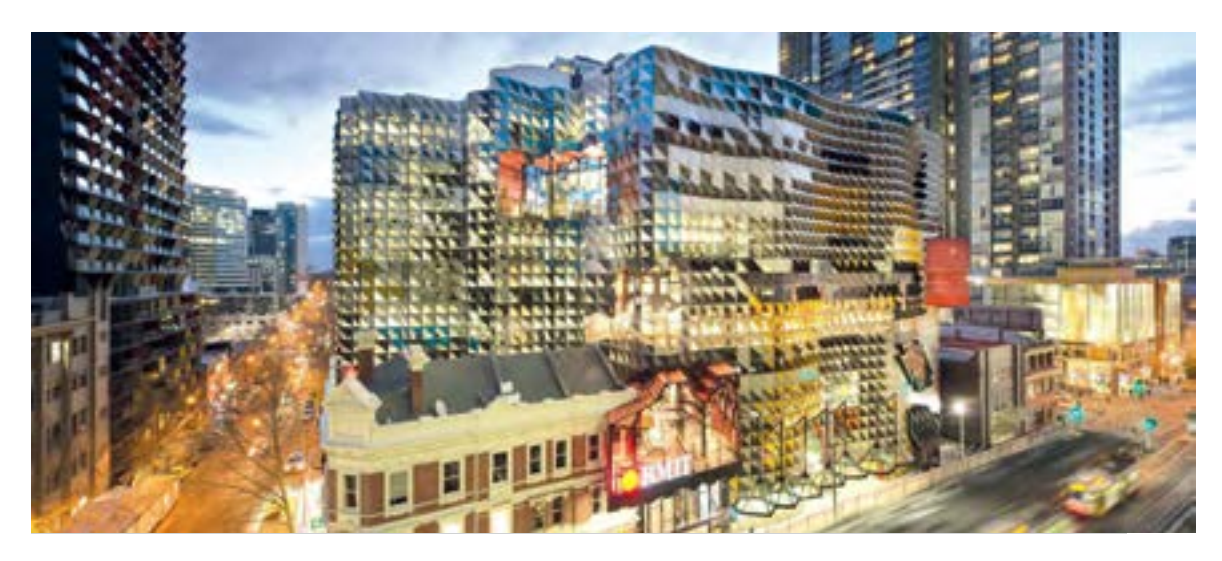
Melbourne City Campus