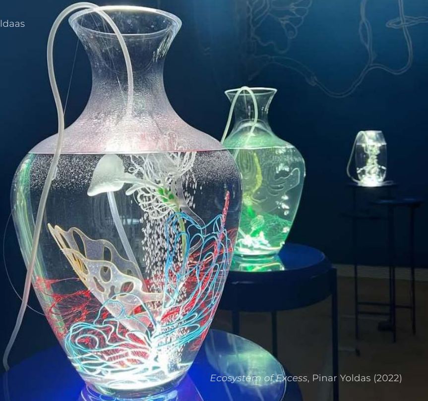
Ecosystem of Excess, Pinar Yoldas (2022)