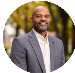
Wednesday, December 6, 2023, 10-11:15am