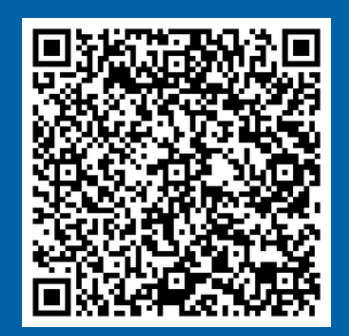
Wifi/ Laptop Loaner Assistance

Financial assistance, including possible loans.